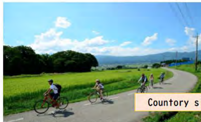
Country side View