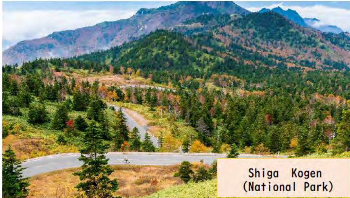
Shiga Kogen (National Park)